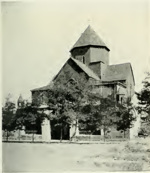
ARMENIAN CHURCH IN RUSSIA